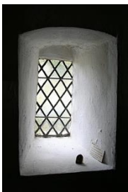
Holy Trinity Church

That may seem like a cruel command, but it was the best way they had to prevent the disease from spreading. And this practice was maintained throughout the world, until fairly recently.