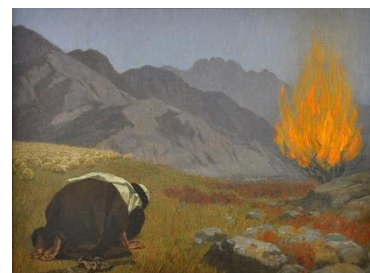
By Gebhard Fugel, c. 1920

God came to him in a burning bush and called him to deliver God's people from slavery in Egypt. And Moses protested several times: "Who am I to go to Pharaoh?" he asked. "Who will I say has sent me? ... What if the people do not believe me?" (Exodus 3-4) And finally this: "O my Lord, I have never been eloquent ... I am slow of speech and slow of tongue." (Exodus 4:10) Does that sound familiar? Jeremiah isn't the first to try this trick!