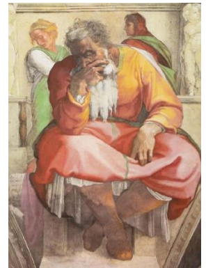
An older Prophet Jeremiah, from the ceiling of the Sistine Chapel, by Michelangelo Buonarroti, 1511.

A prophet should be articulate, have a way with words, be able to make a positive impression upon the audience, even move them, both inwardly and outwardly, toward some tangible response.