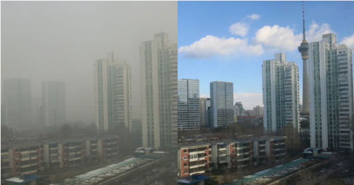
Photo shows same view of the city, one where air pollution is bad, and the other where there is little air pollution.